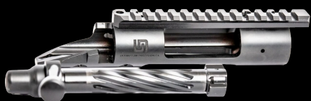
IBI ULTIMATUM HUNTER ACTION